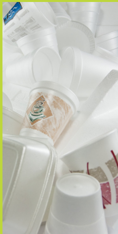
STEP 1 COLLECT FOAM