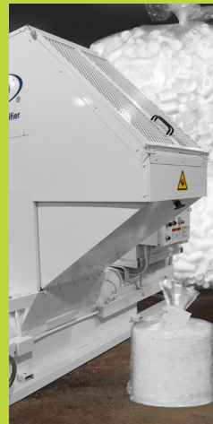
STEP 2 COMPACT THE FOAM SO IT CAN BE TRANSPORTED EFFICIENTLY