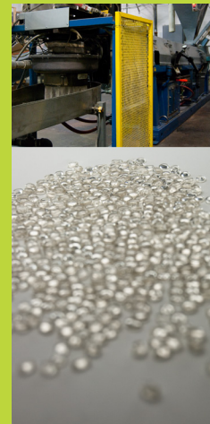
STEP 3 MELT THE COMPACTED FOAM INTO PELLETS